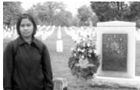
Visiting the Space Shuttle Challenger's memorial in Arlington National Cemetery, Virginia