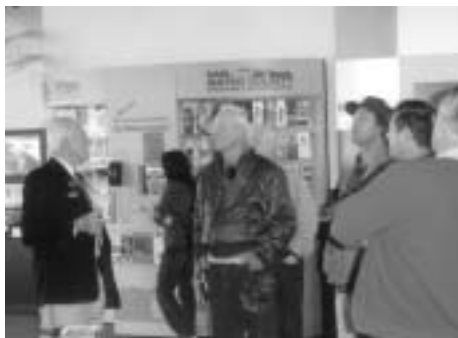
NCW Hiller Museum adult participants

On October 22nd, Cañada College held a career event at their cafeteria and distributed career-related