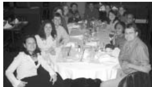
Relaxing after dinner at McCormick & Schmick's Seafood Restaurant at the CNN Center in Atlanta

San Jose State University Department of Chemistry One Washington Square San Jose, CA 95192-0101