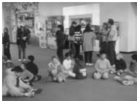
NCW Hiller Museum parent and children participants