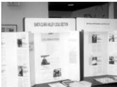
SCV and CHAL displays of inventors and patents related to aeronautics