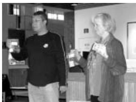
Participating teachers performing numerous tests and learning new ideas to bring back to their class!