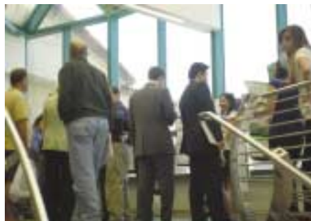
Group shot at the poster session