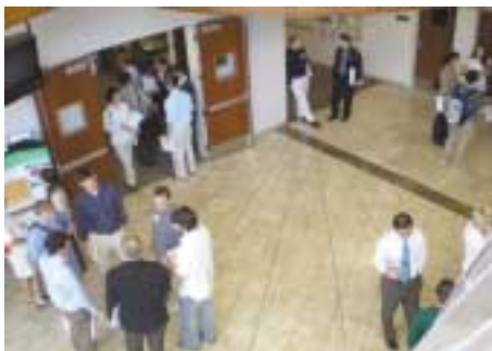
Group shot at the poster session