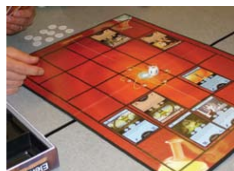
Game Board in Play