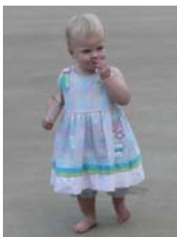
A young chemist analyzes the cake