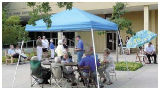
Picnickers enjoying food