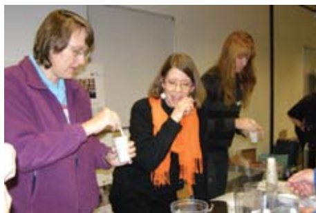
Teachers performing experiments

links to ACS resources for teachers and a discounted rate to become members of RAFT.