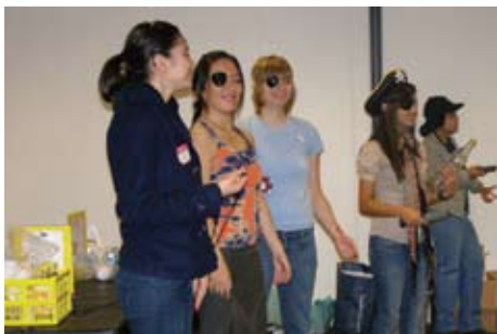
Students helping demonstrate special effects