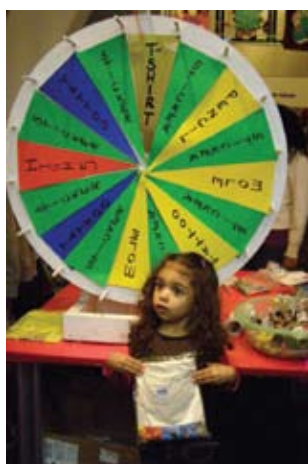
Student volunteers and future chemists enjoying National Chemistry Week

Stay tuned next summer for announcements about National Chemistry Week fun for 2011, during the International Year of Chemistry! GO IYC NCW!