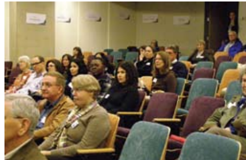
Part of the audience in attendance