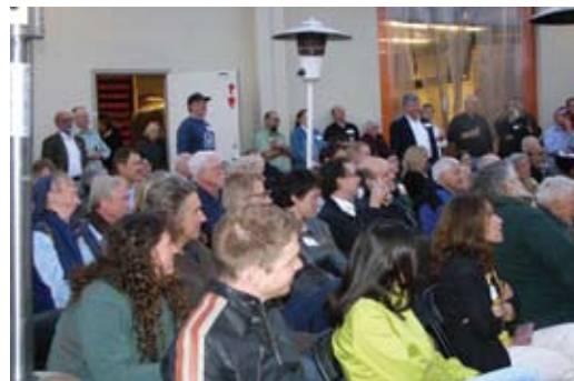
Scene outside of brewery