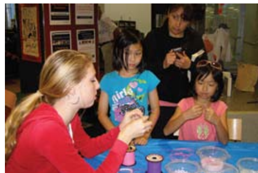
Color-Changing UV Beads