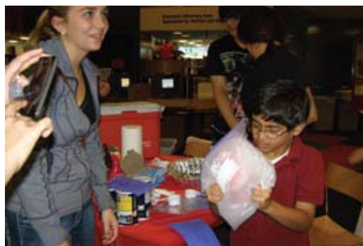
Freezing Point Depression