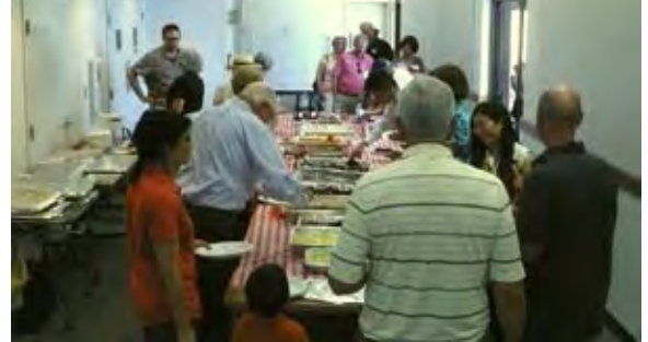
Dinner is served