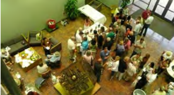
The Keck Lobby during wine tasting